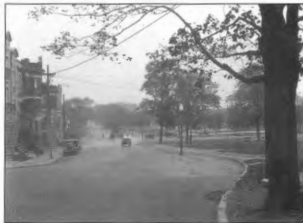
Figure 12.6 RACHEL STREET AND LA FONTAINE PARK, 1930S

The layout of this park and street offer a fine example of urbanized nature, with natural elements well ordered, having been placed firmly under control.