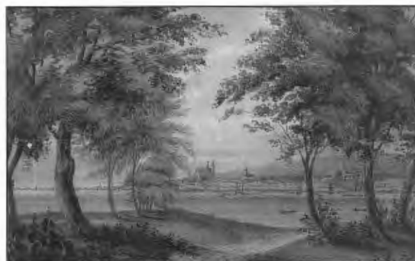
Figure 12.1 JAMES DUNCAN, MONTREAL SEEN FROM SAINTE-HÉLÈNE ISLAND, 1852

Montreal, painted in greys, is framed here in richly coloured pastoral scenery. This is a painting of the city, but a celebration of nature.