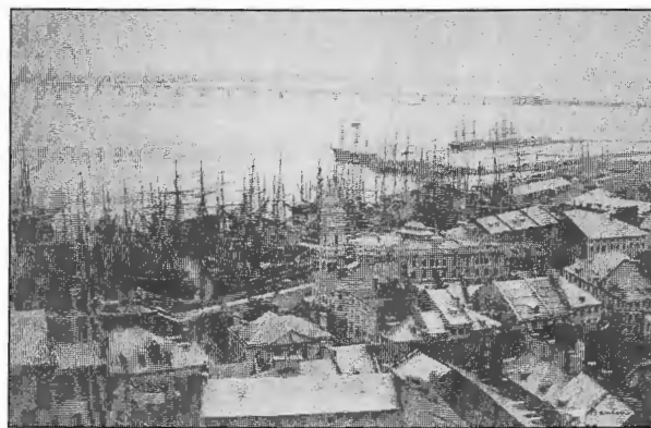
Figure 12.3 JOHN HENRY BARTON, MONTREAL HARBOUR, CA. 1864

Montreal’s freshwater supply source, the St. Lawrence River, was also heavily used as a navigation route.