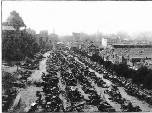
Figure 12.2 E. L. GIROUX, MARKET DAY, CHAMPS-DE-MARS, 1920

Market days were ideal opportunities for obtaining food. They attest to the close interdependence of city and countryside.