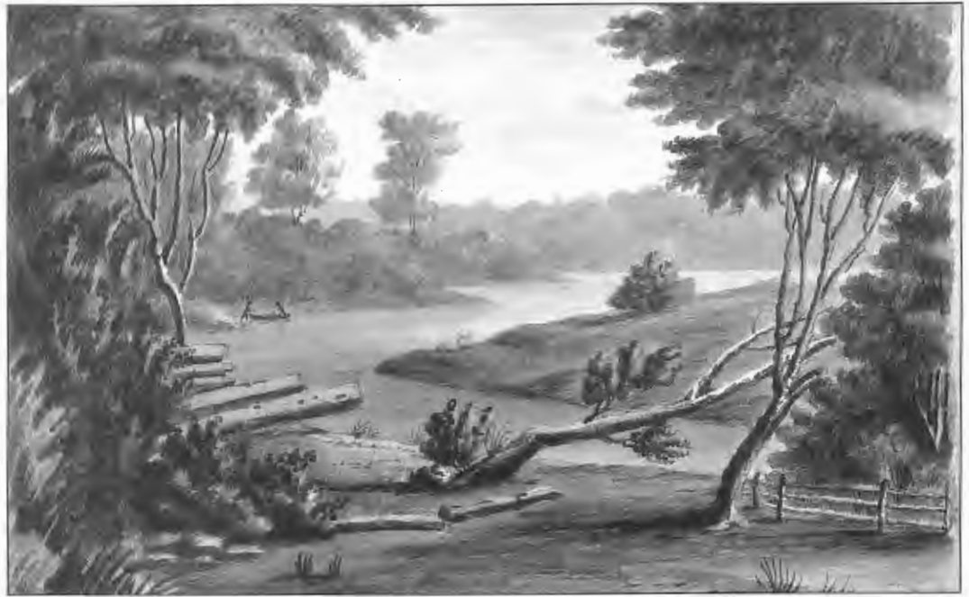
Figure 8.3 ELIZABETH HALE, STREAM AT SAINTE-ANNE

This second Hale sketch depicts the stream near the manor using standard picturesque techniques: three compositional planes, trees framing the image, and the use of dark and light drawing the viewer's eye towards the distance.