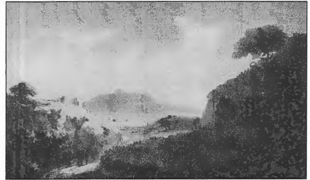
Figure 8.5 WILLIAM GILPIN, "PICTURESQUE MOUNTAIN LANDSCAPE," 1792

One of the chief theorists of the picturesque, English artist William Gilpin provides an archetypal view of a landscape, showing natural variations amidst overall pictorial unity and attracting the viewer's gaze towards the horizon.