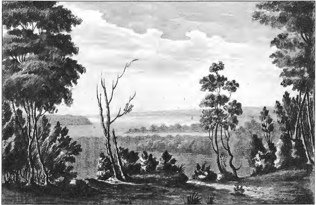
Figure 8.4 ELIZABETH HALE, RIVER IN DISTANCE

The presence of a dead tree, such as the one in the foreground of this Hale drawing of the St. Lawrence River, provides a stock opportunity to contrast mortality with life, offering a moral and spiritual lesson in the landscape.