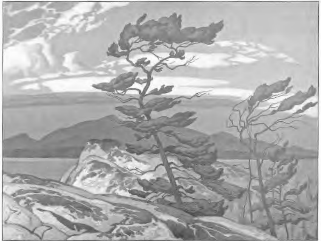
Figure 8.8 A. J. Casson, "WHITE PINE"

A. J. Casson's "White Pine," like many Group of Seven landscape paintings, anthropomorphizes nature, ascribing human characteristics to the tree's struggle to survive in a harsh wilderness. Here the pine tree grows out of the rocks and survives the strong winds that buffet it.