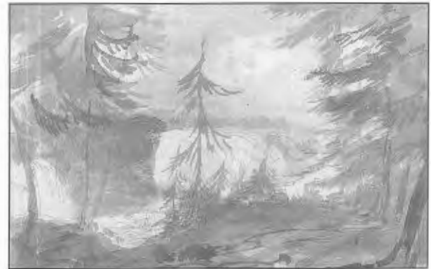
Figure 8.7 ELIZABETH SIMCOE, "NIAGARA FALLS," CA. 1795

Wife of the governor of Upper Canada, Elizabeth Simcoe here sketches the approach to Niagara Falls. She "tames" the sublime landscape of the falls by depicting it in a picturesque fashion, framing the perspective with trees and demonstrating an overall unity to the scene.