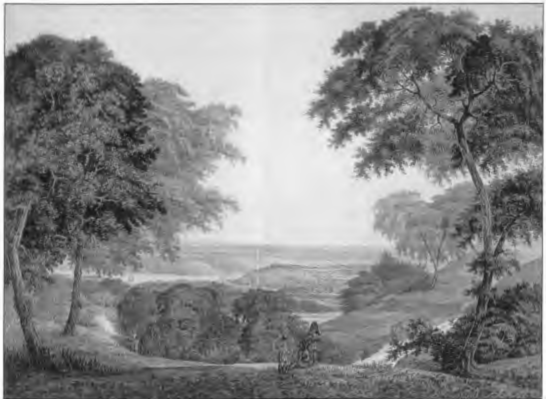
Figure 8.1 GEORGE BULTEEL FISHER, VIEW OF QUEBEC CITY

Trained at Britain's Royal Military Academy at Woolwich, George Bulteel Fisher depicted Quebec City following the conventions of British military topographical painters of his day. Framed by trees, the city is located in the light middle ground, with bucolic figures and scenery in the foreground.