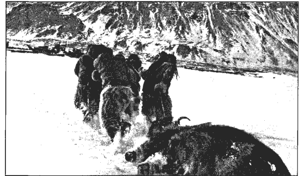
Figure 5.4 HAULING MUSKOX TO CAMP

A party of Inughuit hunters haul a muskox back to their temporary camp on Ellesmere Island. Harry Whitney employed these Inughuit as guides on his 1909 hunting excursions to the island.