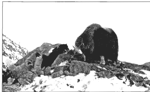
Figure 5.3 MUSKOX AT BAY

American big-game hunter Harry Whitney photographed a muskox being held at bay by Husky dogs during one of Whitney's hunting excursions to central Ellesmere Island in 1909. The combination of firearms technology and Inughuit environmental knowledge proved highly effective in the securing of game animals in this period.