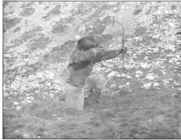
Figure 5.2 INUGHUIT HUNTER

An Inughuit man displays the technique of hunting with a bow and arrow, Etah, Northern Greenland. In the High Arctic, the Inughuit and other Inuit societies relied on projectile technologies for hundreds of years before the bow and arrow was superseded by rifles in the Peary era, 1890–1909.