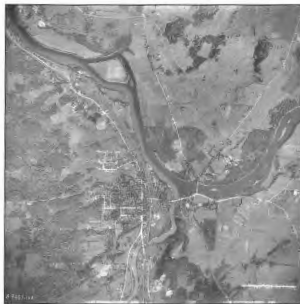
Figure 15.2 SOUTH SECTOR OF SHERBROOKE-LENNOXVILLE, 1945

Widespread agricultural activity is evident in this 1945 aerial photograph of the south sector of Sherbrooke-Lennoxville, which also shows forested and urban areas.