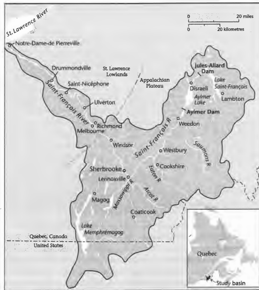
Figure 15.1 LOCATION OF THE SAINT-FRANÇOIS DRAINAGE BASIN

This map shows the location of the main municipalities of the Eastern Townships and rivers of the Saint-François drainage basin.