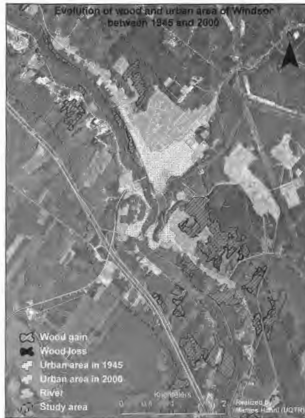
Figure 15.6 EVOLUTION OF WOOD AND URBAN AREAS OF WINDSOR, 1945–2000

Especially along the riverbanks, forested areas grew markedly in Windsor during the second half of the 20th century, a change that can be observed in this georeferenced aerial photograph.