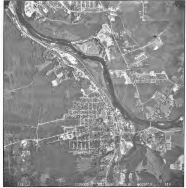
Figure 15.3 SOUTH SECTOR OF SHERBROOKE-LENNOXVILLE, CA. 1979

By 1979, many formerly agricultural areas in the south sector of Sherbrooke-Lennoxville had been replaced by urban development.