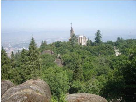
The summit of Mount Penha overlooking the city of Guimarães