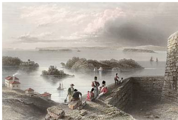
View from the Citadel of Kingston. 1841 Original steel engraving drawn by W. H. Bartlett, engraved by R. Wallis.

http://www.mezev.info/FamilyAlbum/PLACEalbum/CAN-ON.WolfeIsland.html