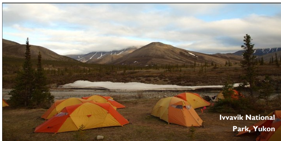
Ivvavik National Park, Yukon